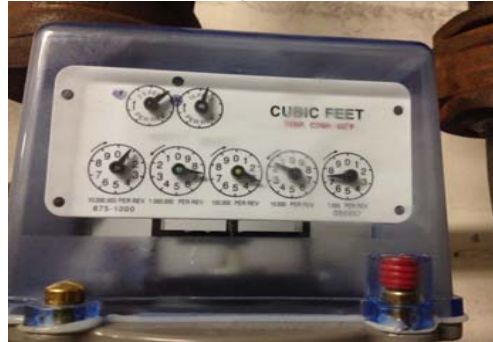
July 29 2015 ConEd meter reading